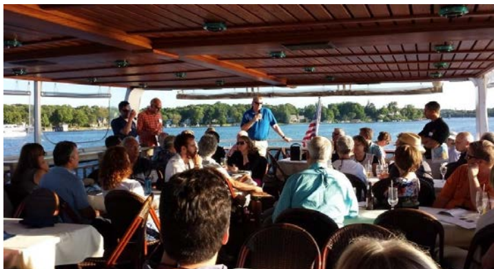
Workshop-on-the-Water included “The Guided View: lake and stream health and the impact of shorelines and streambanks”