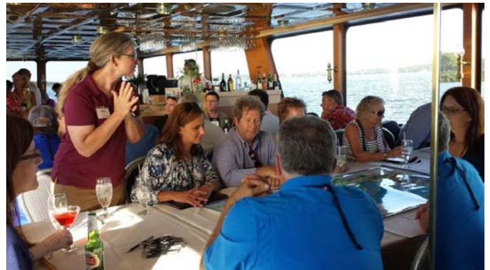
The Watershed Game. Leaders select plans, practices policies to meet a clean water goal.

The NEMO format has high educational value for participants; being on the water greatly enhanced their learning experience