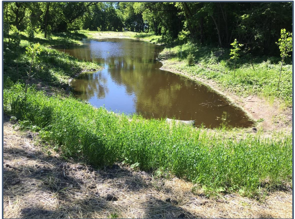
Jennings Bay Floodplain Mitigation, May 31

The Jennings Bay Floodplain Mitigation and Wetland Restoration, which provided compensatory storage for the Bushaway Road Shoreline Restoration, reached substantial completion in April 2017. The as-built survey is currently being finalized and warranty period vegetation maintenance has begun on the site. The floodplain area handled early season rains well and the seeded and planted vegetation is establishing with weed control by the vegetation subcontractor.