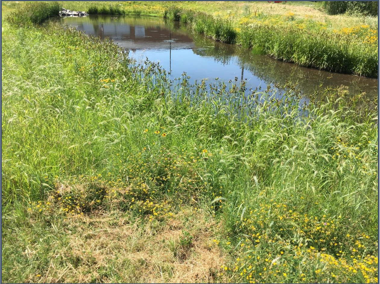
Japs Olson Filtration Basin, July 6

The project elements of the Japs-Olson Minnehaha Preserve Enhancement are in the midst of both maintenance and construction. The infiltration basins are within their second year of warranty period maintenance. The upland and pond edge vegetation is establishing well despite the highly variable moisture conditions. The inlet of the second basin experienced some significant sedimentation and erosion and is currently being repaired.