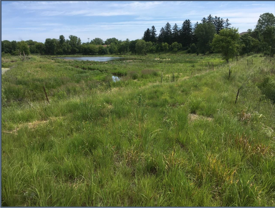
Long Lake Creek Wetland Restoration, June 27

The Long Lake Creek Wetland Restoration is in its third year of warranty maintenance. Native vegetation is establishing well, and hybrid cattail and reed canary grass, invasive plants that were once dominant on the site, were reduced during construction and are only minimally present now due to management efforts. Buckthorn has been eliminated from the site and neighboring residential properties to protect the investment the District made in establishing native trees and shrubs on the site. The remeandered streambank is stabilized with native plants, and the entire site has withstood heavy spring and summer rains with no damage.