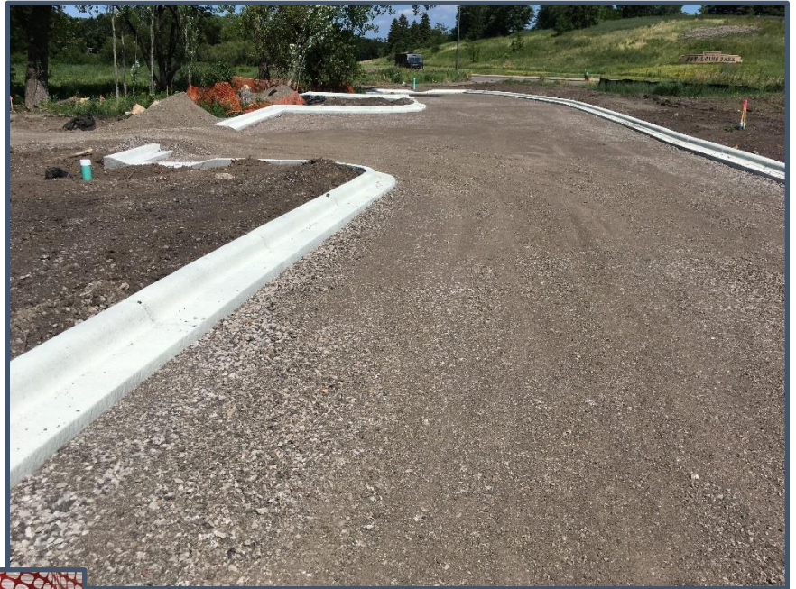
Minnehaha Preserve Trail Connection Parking Lot, July 6

The trail connection and parking lot construction are nearing completion. The boardwalk sections over lower portions of the trail are complete as is the connection to the Preserve boardwalk. Concrete curbs have been poured, and the bituminous trail will be completed within the next several days. Trees and shrubs planted to provide screening to Excelsior Boulevard will be a final construction element. The 50 th Anniversary Celebration Greenway Clean-Up scheduled for July 23 will include the area around the trail connection and will serve to remove accumulated litter in the vicinity.