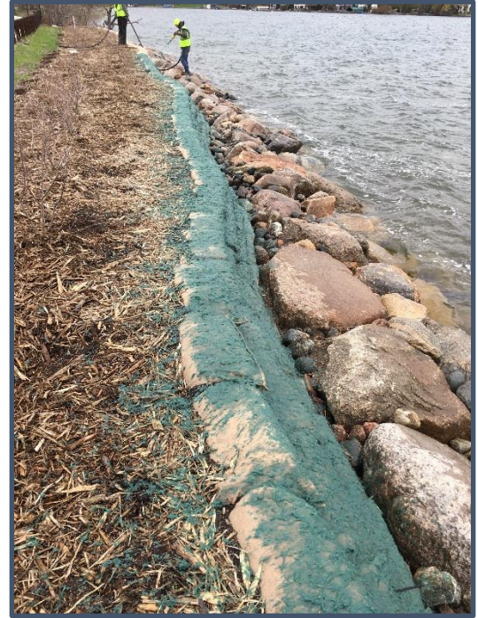
Hydroseeding the Bushaway Road soil slope, April 27

The Bushaway Road (Highway 101 Causeway) Shoreline Restoration project reached substantial completion in May with planting and hydroseeding of the soil slope being completed. Trees and shrubs are beginning to establish along with the seeded areas on top of the wall. The hydroseed applied to the soil slope itself has been slow to germinate. District staff met on site with the vegetation subcontractor, the project engineer, and the manufacturer of the wall material on July 6 to determine a method to provide for better germination of the native seed. It was determined that soil moisture availability is likely the limiting factor, so the vegetation subcontractor will extend the existing drip irrigation line to provide water to the soil slope and germinating seed. Plant cover will be assessed in September and next steps will be determined based on the vegetation condition at that time.