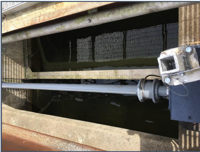
Gray's Bay Dam, March 22

Inspection and follow-up maintenance of the Gray's Bay Dam was a need identified in the process of drafting the updated O&M manual. PMLM staff contracted with Wenck Associates to perform an inspection of the dam gates, cables, gear boxes, stoplogs, and their associated seals. Wenck provided a report detailing needed maintenance and Blackstone Construction was selected to replace the seals on the dam gates and replace the cables and gear boxes. The steel veneers that indicate the width of the dam opening will also be improved. At this time, all gear boxes and cables have been replaced and the remaining repairs will be completed this summer. Wenck also included in their report specific maintenance intervals for the dam equipment. The gate cables and seals on the dam gates and stop logs will require maintenance again in 10 years. The gear reduction mechanisms and the width opening veneers should be serviced in 20 years.