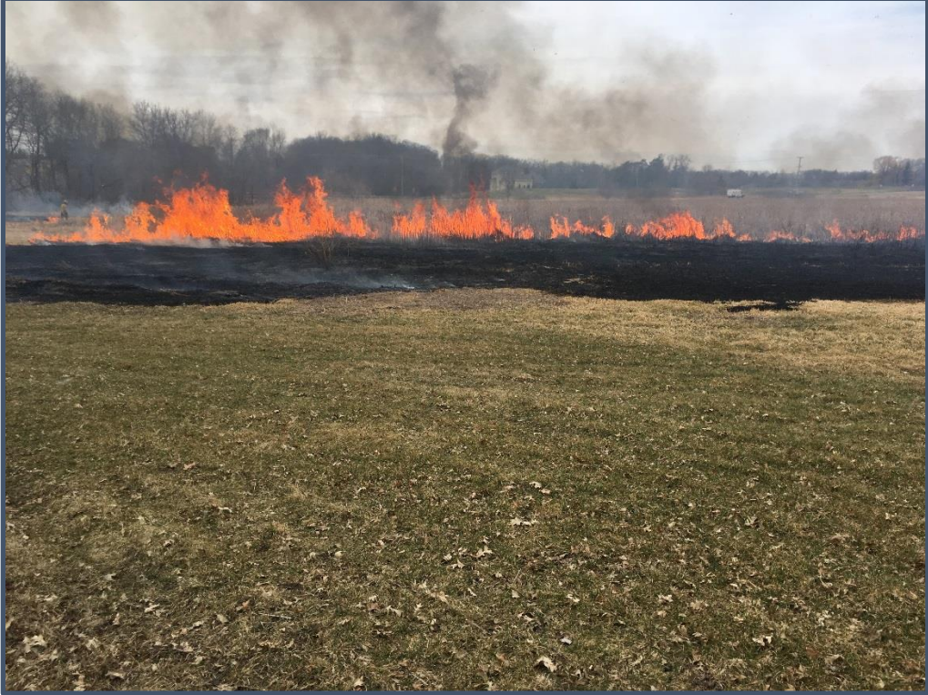
Independence Wetland during prescribed Burn, April 5 (above), and lake sedge after green-up, June 7 (below)

Between March 31 and April 30, contractors for MCWD conducted prescribed burns at Gideon Glen in Shorewood, Independence Wetland, Minnehaha Creek Headwaters Shoreline in Minnetonka, Long Lake Ponds and Shoreline, Twin Lakes Park Ponds in St. Louis Park, and the Johnson-Rolling Hills property in Minnetrista. Spring prescribed burns are utilized to control cool season grasses and perennial broadleaf weeds, return nutrients to the soil, and favor growth of warm season grasses and forbs.