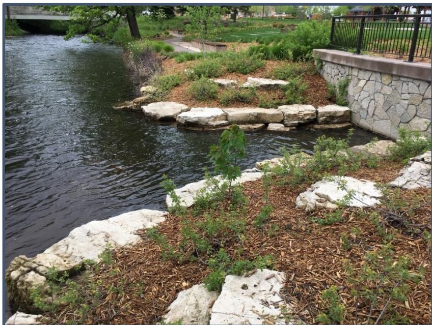
Cottageville Park, May 18

Cottageville Park is in its second year of warranty maintenance. Continued coordination with the landscape subcontractor has led to improved vegetation condition and weed management. In 2018, this project will receive a third year of warranty maintenance under a bid alternate. Interpretive and informational signage was installed recently, and the City of Hopkins has completed the pavillion.