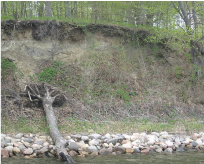
East-end shoreline before restoration